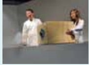
● Science shows