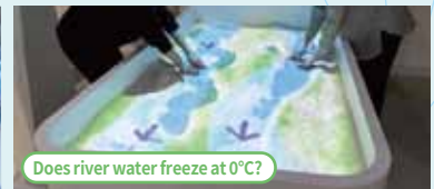
Does river water freeze at 0°C?