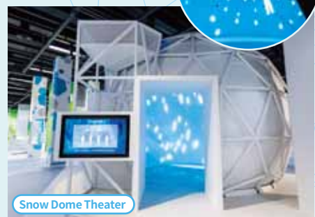
Snow Dome Theater