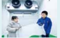
● Low Temperature Playground