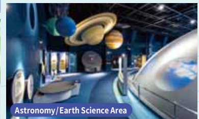
Astronomy/Earth Science Area