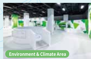
Environment & Climate Area